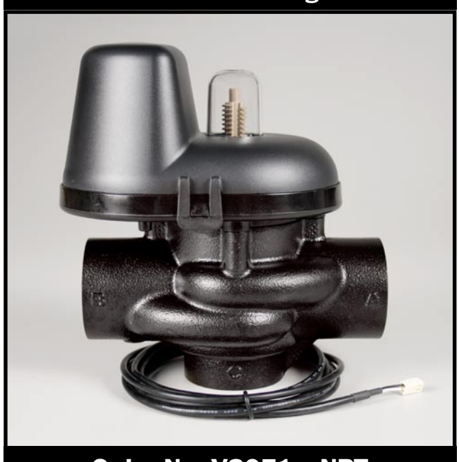
Order No. V3071 • NPT Order No. V3071BSPT • BSPT